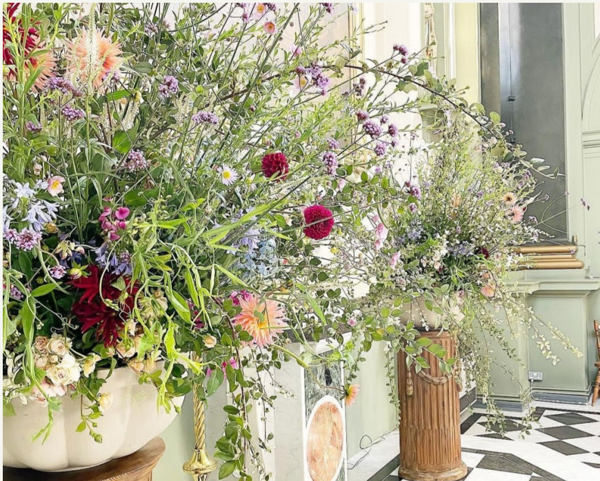
Shane Connolly Flowers The Church of the Most Holy Redeemer London