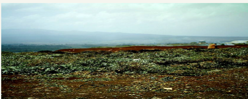
POOR DISPOSAL OF WASTES FROM FLORICULTURE FARMS IN ETHIOPIA

The place of flowers in our lives remains as important as ever, associated as they are with life-events, emotion, language and communication. It is good that they endure, not least as a way to express what it means to be human.