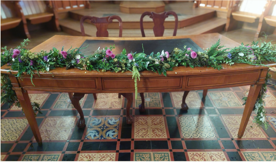
Camomile & Cornflowers Stanbrook Abbey, Worcester