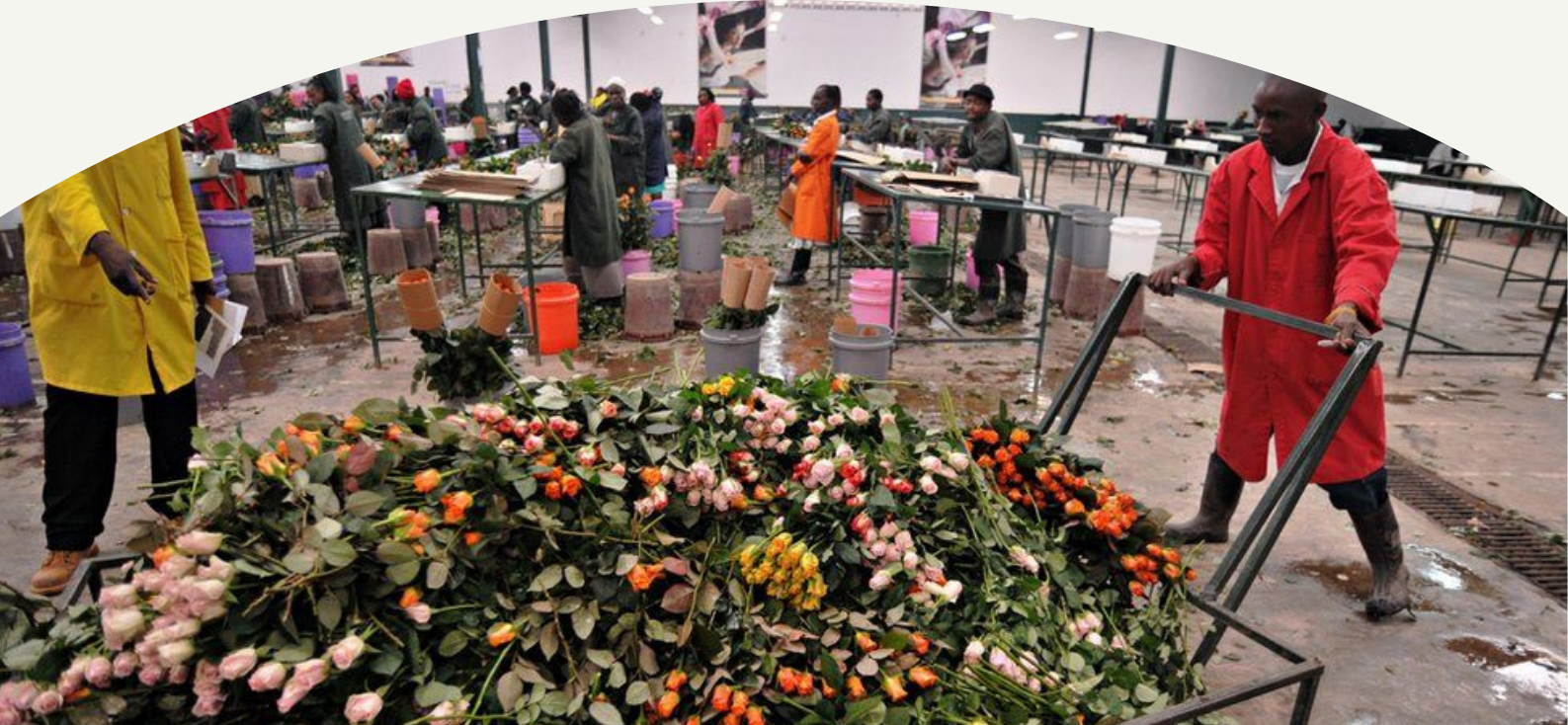
FLOWER PRODUCTION IN KENYA