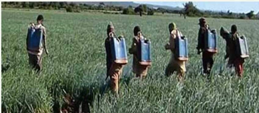
PESTICIDE SPRAYING IN ETHIOPIA LARGEST ROSE GROWER IN THE WORLD

The international culture of floristry has been for many decades - and indeed largely remains - one driven by the demand for cheap flowers available at any time of year. Wholesalers, retailers and supermarkets have all played their part in encouraging and facilitating this demand.