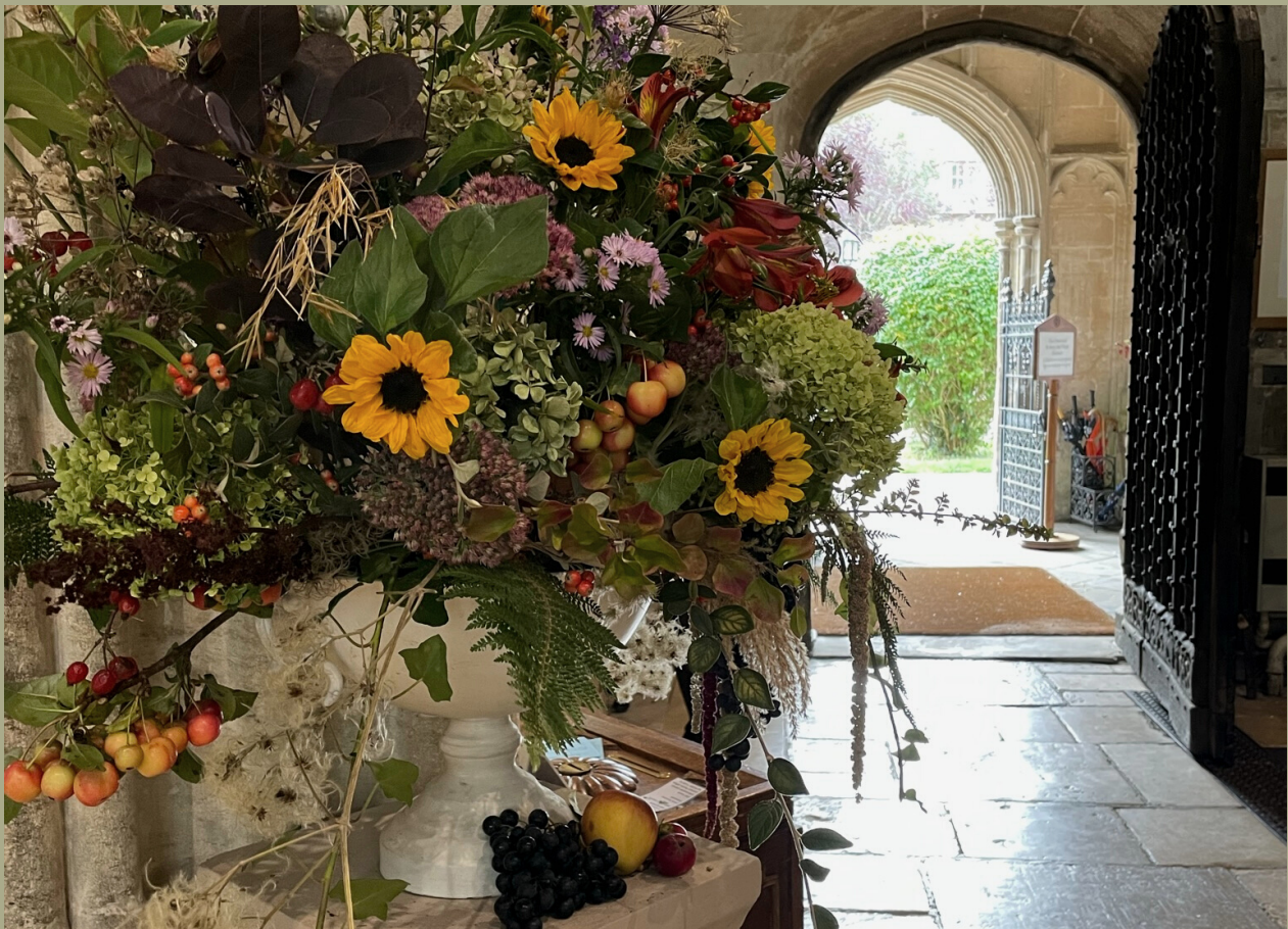
Honeymoon farm St Mary's Church Fairford